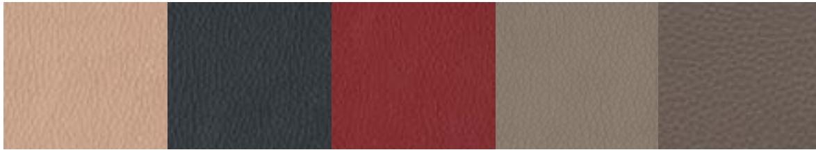
Rosa Blu Bordeaux Tortora Fango