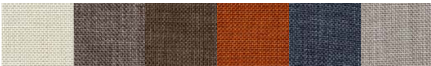
Flirt ecrù Flirt cemento Flirt maron glasè Flirt arancio bruciato Flirt blue jeans Flirt grigio lino