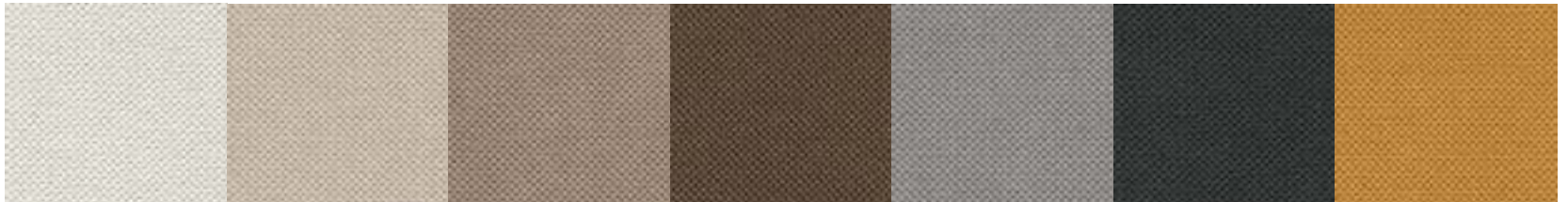
Point 01 Point 11 Point 14 Point 28 Point 06 Point 16 Point 05